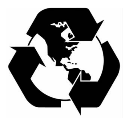
Reduce, Reuse, and Recycle